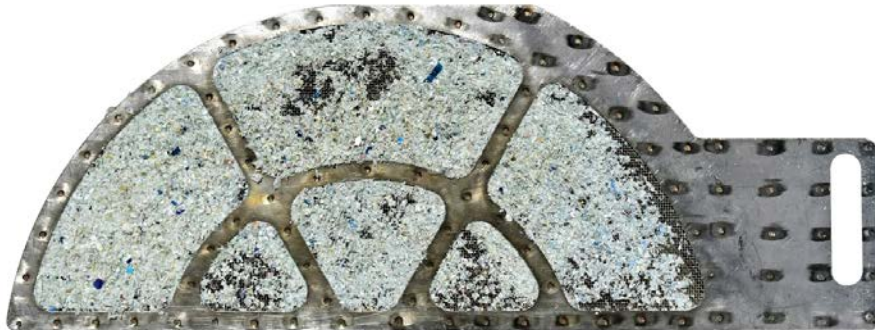
With rPET contaminated metal filter before cleaning